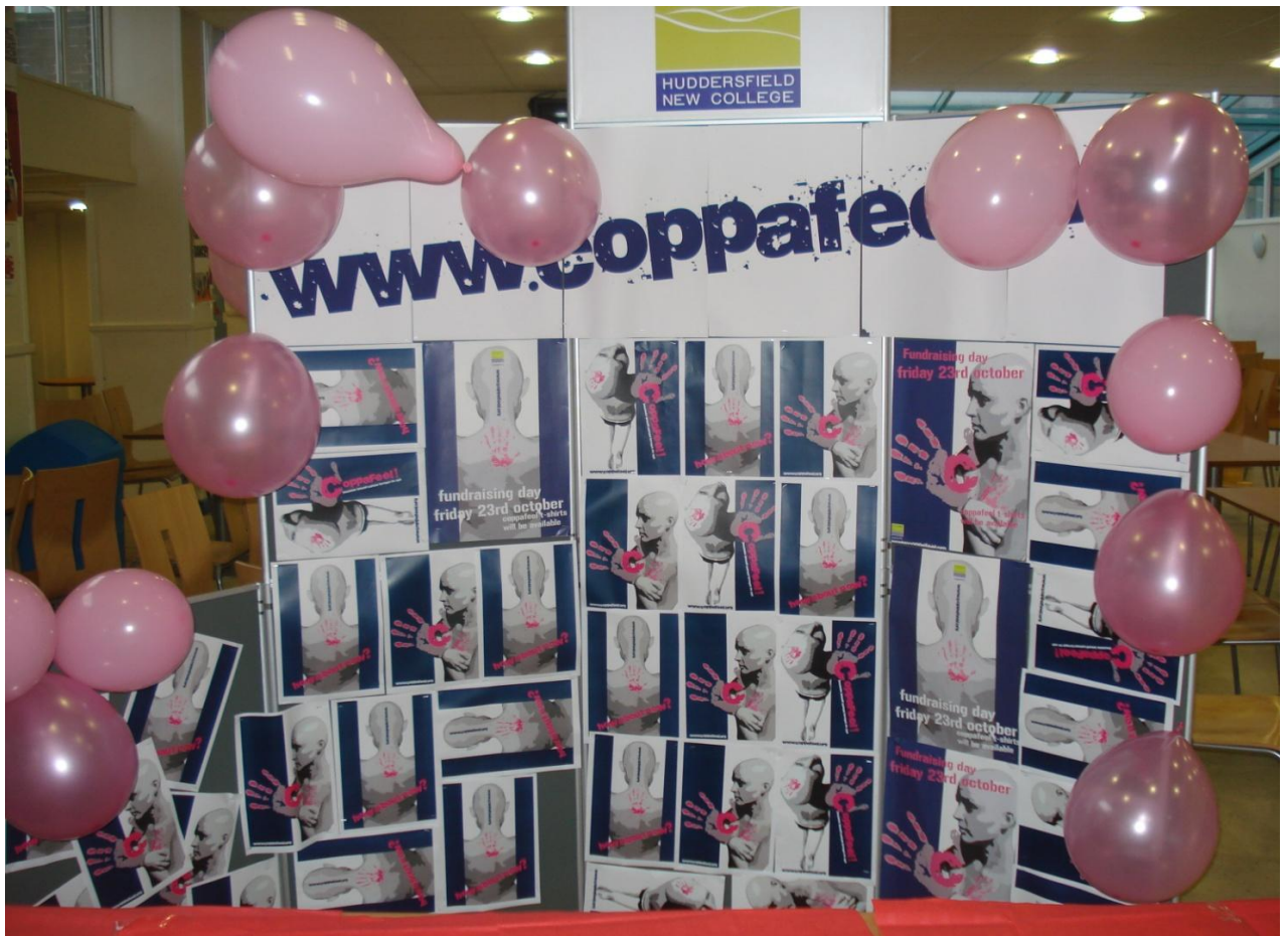
Breast Cancer Awareness Day – October 2009