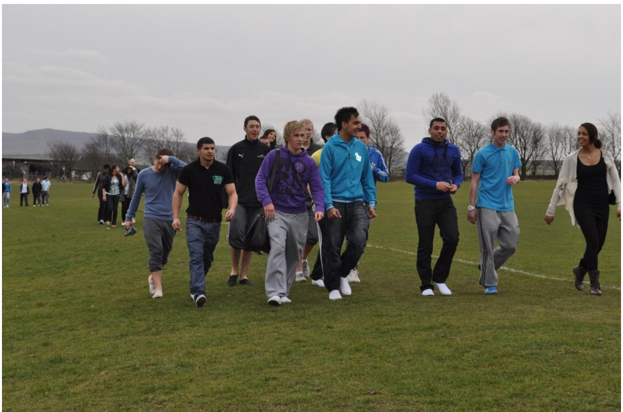
Sport Relief – March 2010