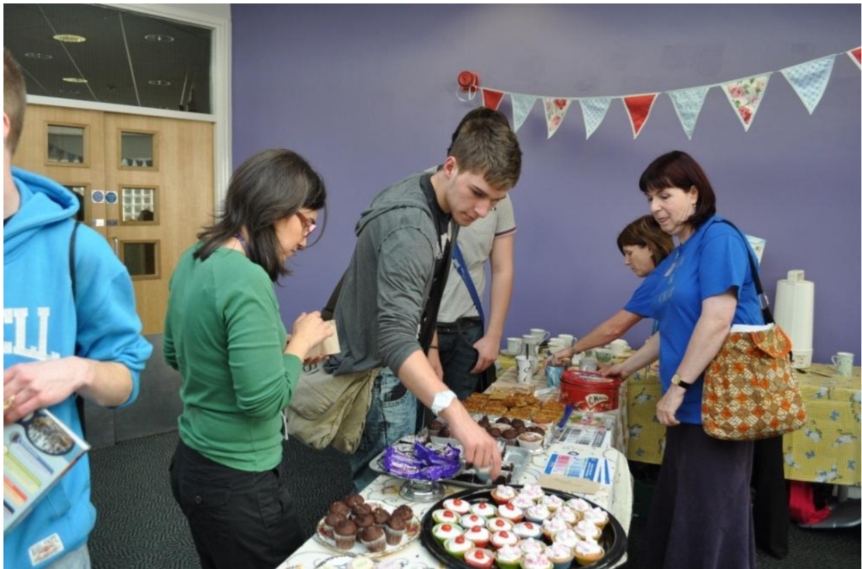
Tea and Chat day – 7 th October 2010