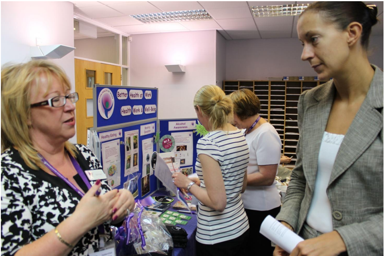
Better Health at Work Launch – September 2010